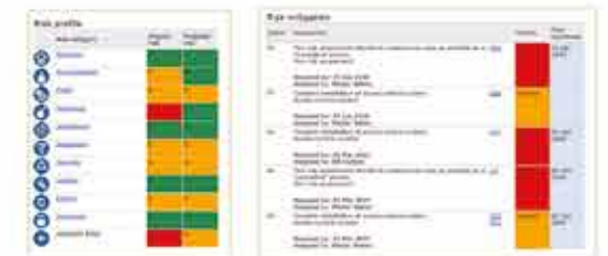
Assessing an individual property displays key data in clearly defined sections