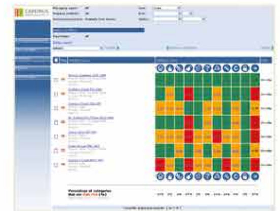
Task manager is PACE's workflow management system. Assessments and recommendations are clearly presented on the survey reports