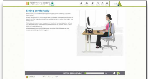
Users are given pointers on how to make their workstation more comfortable

Healthy Working is the world's leading office ergonomics e-learning and self-assessment solution. Designed in partnership with the Health and Safety Laboratory, Healthy Working is a personalised e-learning experience tailored to the needs of individuals in your organisation. Accompanied with PACE, a purpose-built management module, it offers organisations a secure resource to deliver customised DSE training, self-assessment and risk prevention.