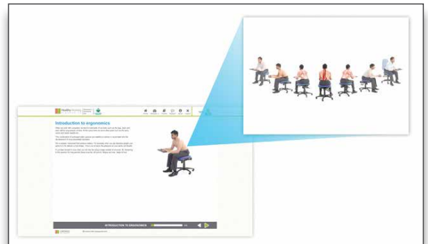
Healthy Working educates users on the stresses poor posture can place on the body

Call Cardinus today on 0207 469 0200 to arrange a free evaluation