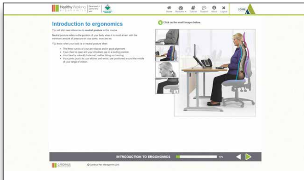
Healthy Working guides users through an easy-to-follow process